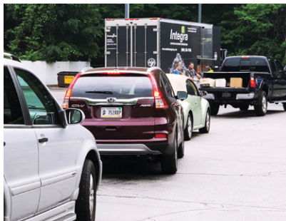
Cars line up to drop off their sensitive documents for shredding.